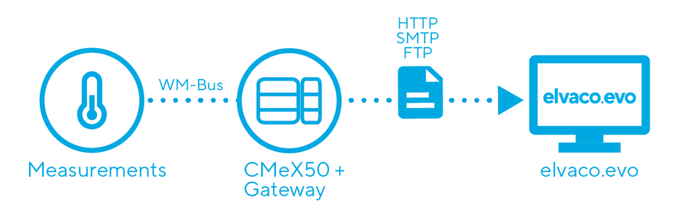
Figure 1 Application example

Following figure shows an example of how the Elvaco Sense can be used in an Elvaco end-to-end solution.